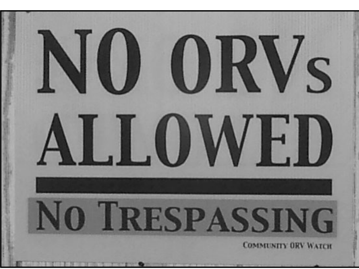
Sign distributed by Community ORV Watch in San Bernardino, Calif.

But even if the route designation results in the closure of inappropriate