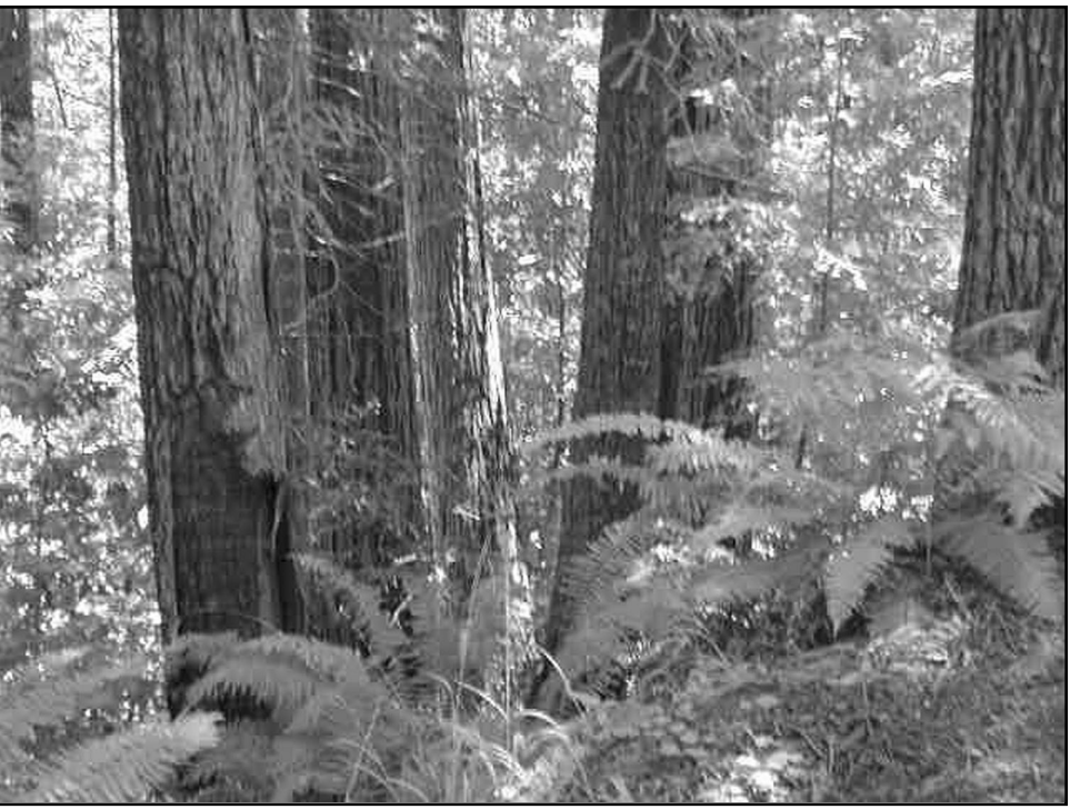
Trees marked for cutting in Jackson State Forest

Taylor's group wants to see Jackson Forest managed for other values than timber. It opposes the plan's clearcutting, large-scale commercial logging, logging of oldest second-growth stands, inadequate stream protections, herbicide use, and lack of a plan to expand recreation.