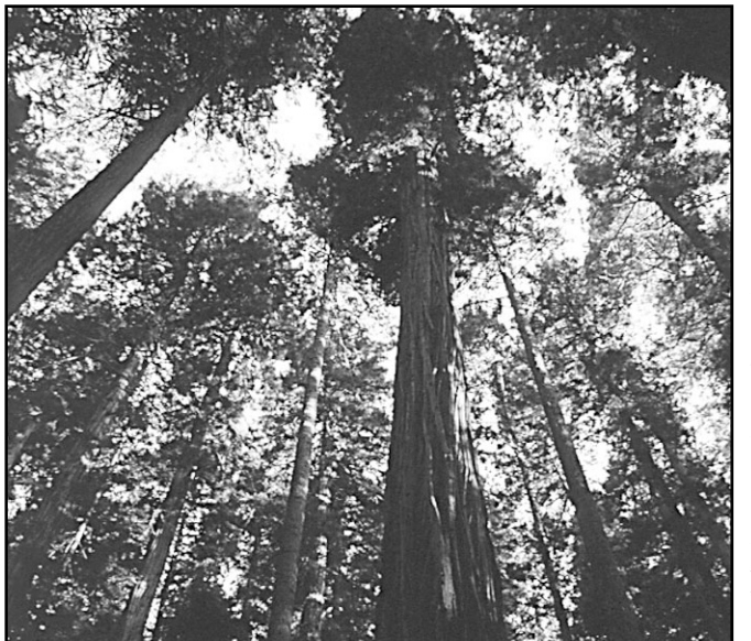
Coast redwoods in Headwaters Forest

Old-growth trees provide essential ecological services, helping to produce clean water and sequestering carbon dioxide– a major contributor to global warming. "Some California oldgrowth forests," the bill reads, "sequester more carbon than any other forest type on Earth."