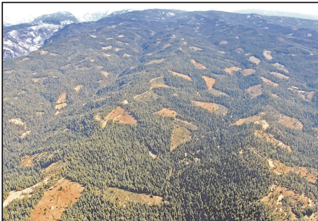
To study the cumulative impacts of Sierra clearcuts requires poring over dozens of timber harvest plans.