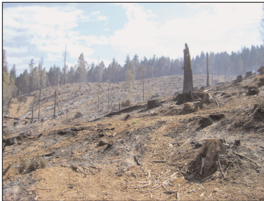
A recent clearcut scars this slope in Calaveras County.

forestry reform bills and sponsor an array of other environmental measures. It represents as well the establishment of Forests Forever as Sacramento's sole environmental advocacy group dedicated year-round