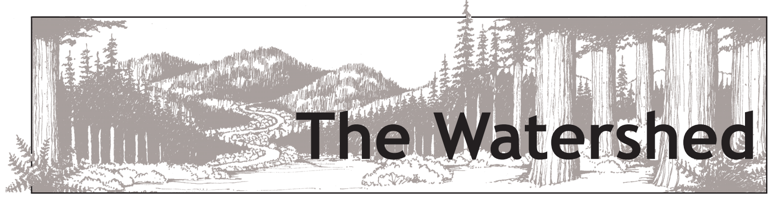
Volume 12, Number 2