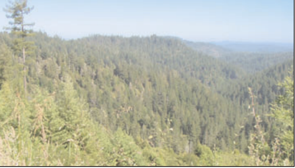
Jackson State Forest gets a management makeover

Meanwhile Jackson State Forest in Mendocino County will now be managed with the help of a strong new advisory committee that should eliminate industrialstrength logging there.