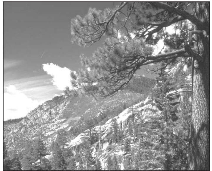
Inyo National Forest