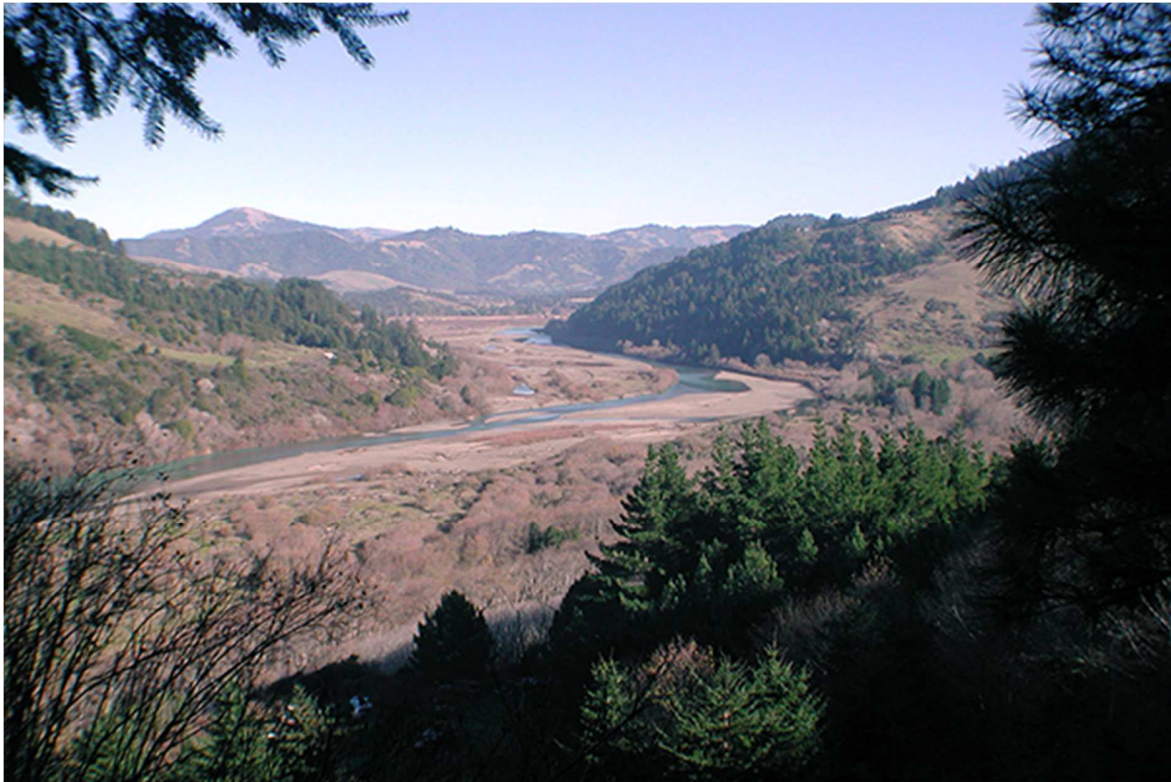
The Mattole River

But that's not to say the state's timber conflicts are over. They're not full-blown campaigns with the civil equivalent of armor, infantry and air support—more like a simmering insurgency characterized by intractable hotspots. And perhaps the hottest spot these days is Rainbow Ridge, an 18,000 acre tract on the headwaters of the upper and lower forks of the Mattole River. The battle over Rainbow Ridge isn't about old-growth redwoods, however. It's centered on Douglas firs.