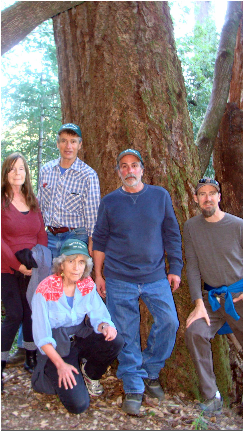
The Lost Coast League members before an old-growth Douglas Fir, near the disputed Humboldt Redwood Company holdings