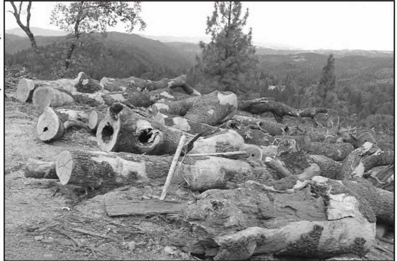
These ecologically precious oaks will be burned on site to make way for a plantation.

of its timber harvests approved for clearcutting during the same period.