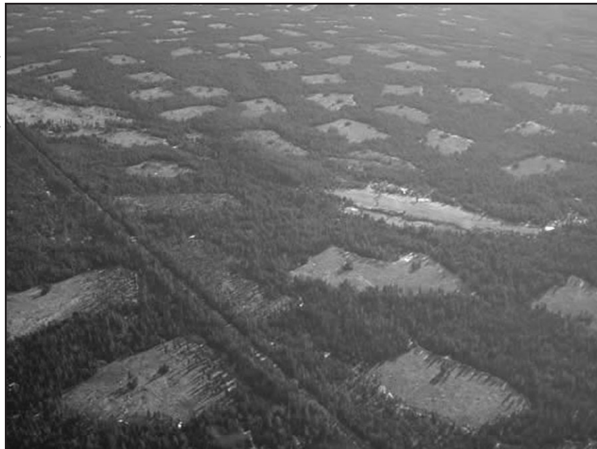
Aerial view of clearcuts scattered across landscape near Lassen Peak