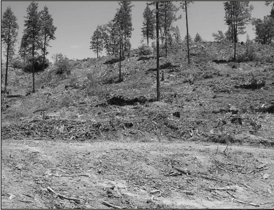
(left) After the area is clearcut, herbicides are applied to kill brush and other species of trees that might compete with commercial plantation trees. Here the herbicide treatment has killed nearly all the understory vegetation.