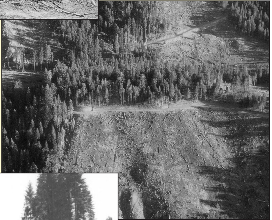
(below) In this clearcut, the litter of small logs, branches, and brush known as “slash” is left behind when the commercially valuable trees are removed. The stand of trees in the right rear were left vertical in what the timber companies call a “visual retention group.”