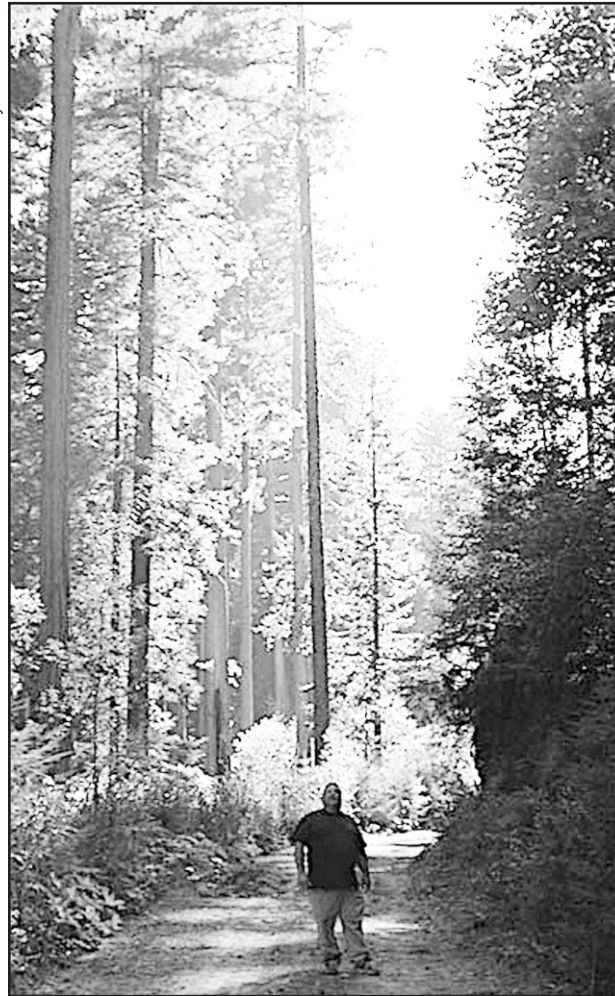
Stromsmoe in a forest he loved: Headwaters Forest Reserve, 2001.

Many people were surprised when they learned that such a staunch advocate of environmental causes also was a Republican.