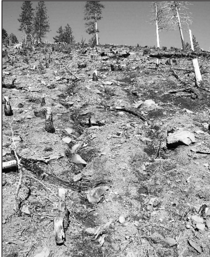
Erosion scars this five-year-old steep-slope SPI clearcut in Calaveras County.

good for forest health, taking out "excess" trees much as a forest fire would do.