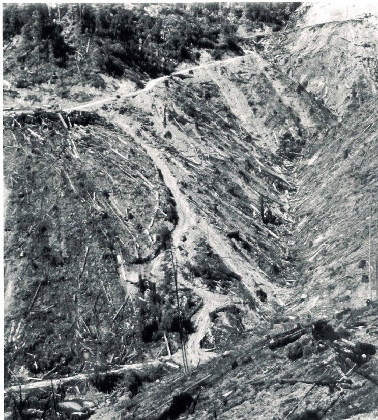
Figure A-5. The Usal Creek watershed in 1980.