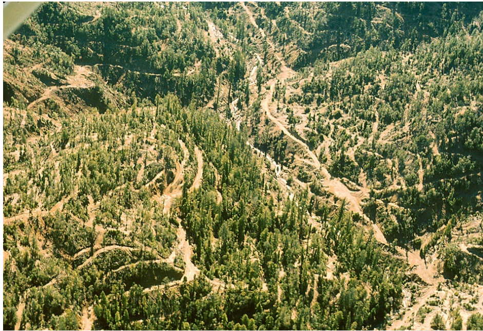
Figure A-4. The Usal Creek watershed in 1977.