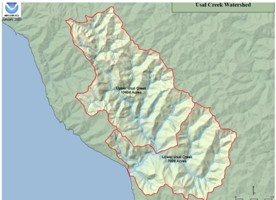
Figure A-2. Map of the Upper Usal Creek and Lower Usal Creek planning watersheds.