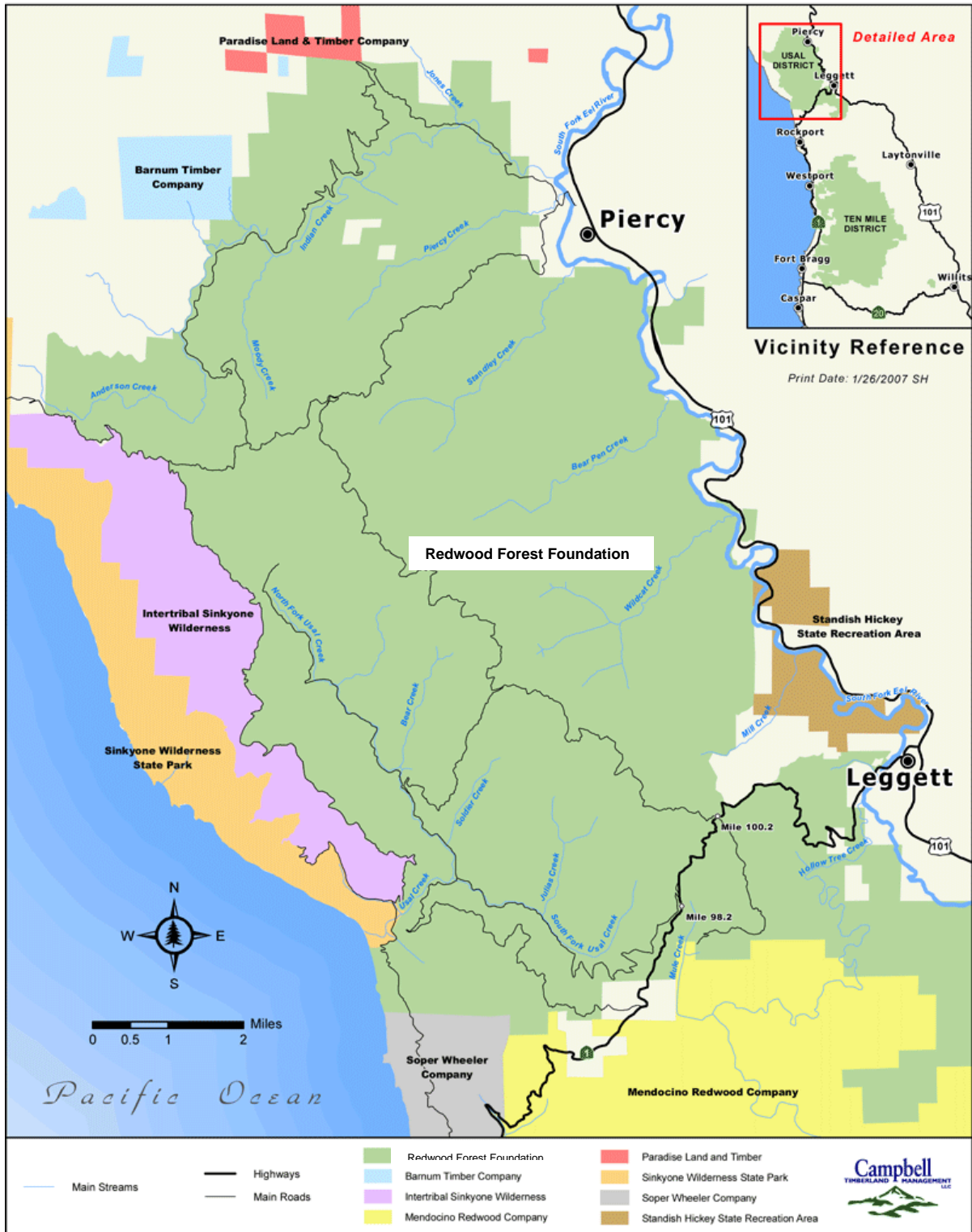
Figure A-1. Map of the Usal Redwood Forest, located in coastal Mendocino County.