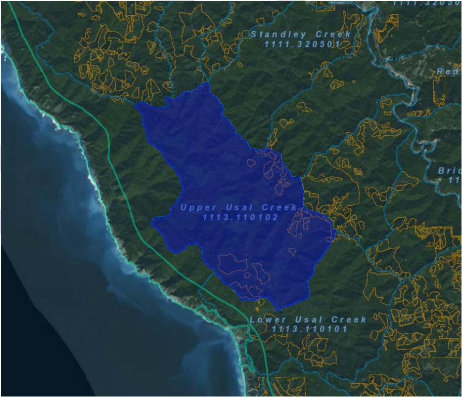
Figure A-3. Map of the two planning watershed with harvest history from CAL FIRE's Watershed Mapper.